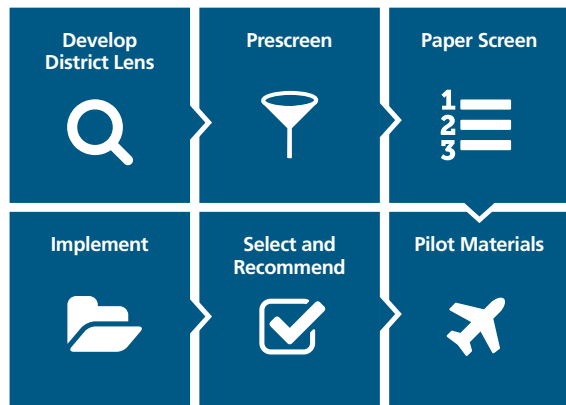
Figure 3: California Tool for Instructional Materials Evaluation Steps

As a way to support LEAs in this process, in December 2018, the NGSS Collaborative (comprising the California County Superintendents Educational Services Association-Curriculum and Instruction Steering Committee Science Subcommittee, California Science Project, California Science Teachers Association, K-12 Alliance @ WestEd, CDE, and State Board of Education) introduced the California Tool for Instructional Materials Evaluation (CA TIME). Many county offices of education have and continue to offer trainings to district leaders as they move forward with NGSS-aligned curriculum adoptions. The process and recommended toolkit can be found in the resources section of this brief. It is important, before beginning the adoption process, that LEAs review their goals and focus on what priorities have been identified before beginning the NGSS adoption process.